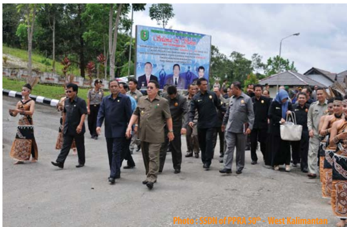
Photo : SSDN of PPRA 50 th - West Kalimantan

The participants will be able to further improve their ability by discovering strategic issues in the regions and obtaining information, data and facts to be used as their materials in studying national resilience in the regions. They will also be able to validate the measurement of national resilience in the regions in order to enhance the comprehensiveness of their seminar materials.